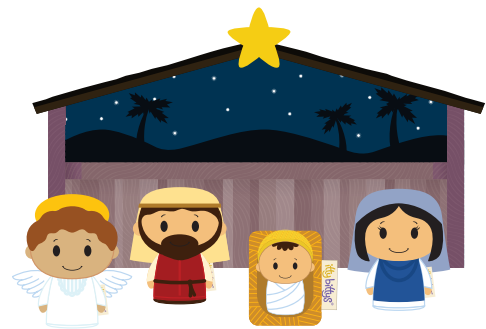
ITTY BITTYS® NATIVITY SET* AVAILABLE HOLIDAY 2015